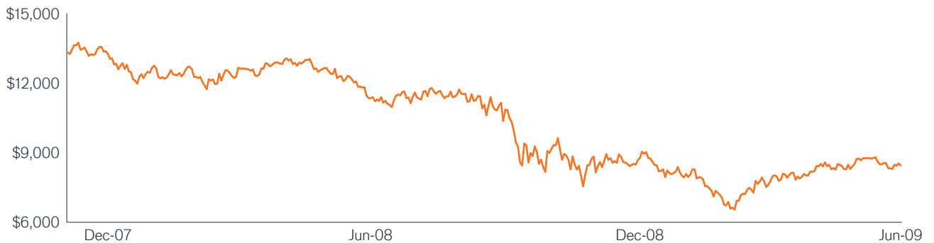
Daily closing levels for the Dow Jones Industrial Average from 12/3/07 - 6/30/09

During the recession beginning in 2007, the extreme dips in the market made it hard for investors to see beyond the volatility. In such difficult times, it's not easy to look past the current state of the market and focus on the long term.